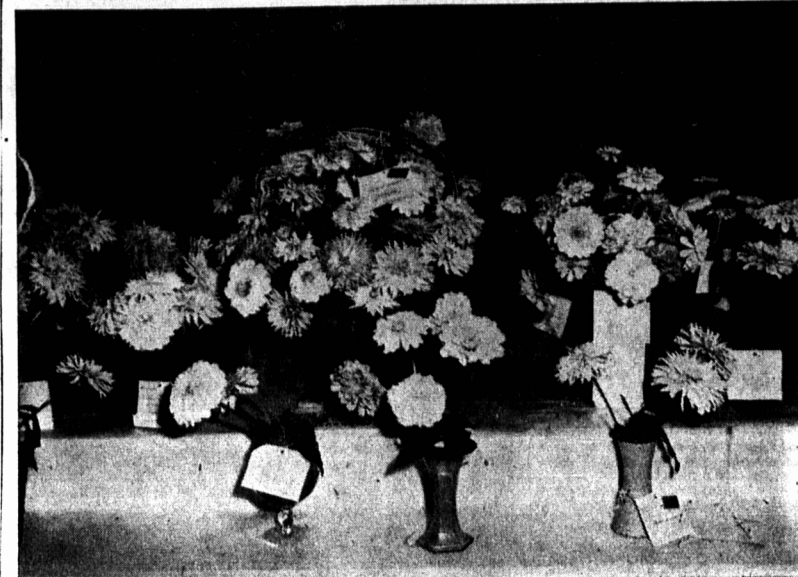
The multi-colored zinnias were sored by the Abegweit Chapter of flowers. A colorful part of the exhibits at I.O.D.E., which concludes at Summerville Provincial Flower Show sponsored this evening with a sale.