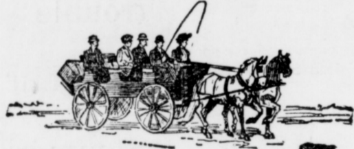
NEW PATIENTS ON WAY TO HOSPITAL

No effort is being spared to meet every call. . . . Not a single applicant has ever been refused admission to the Free Hospital because of his or her poverty,