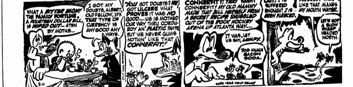
By Walt Kelly