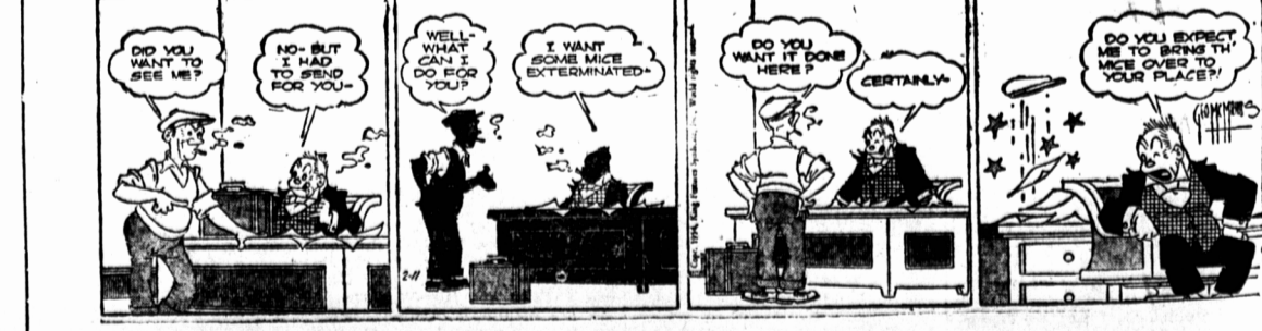
By George McManus