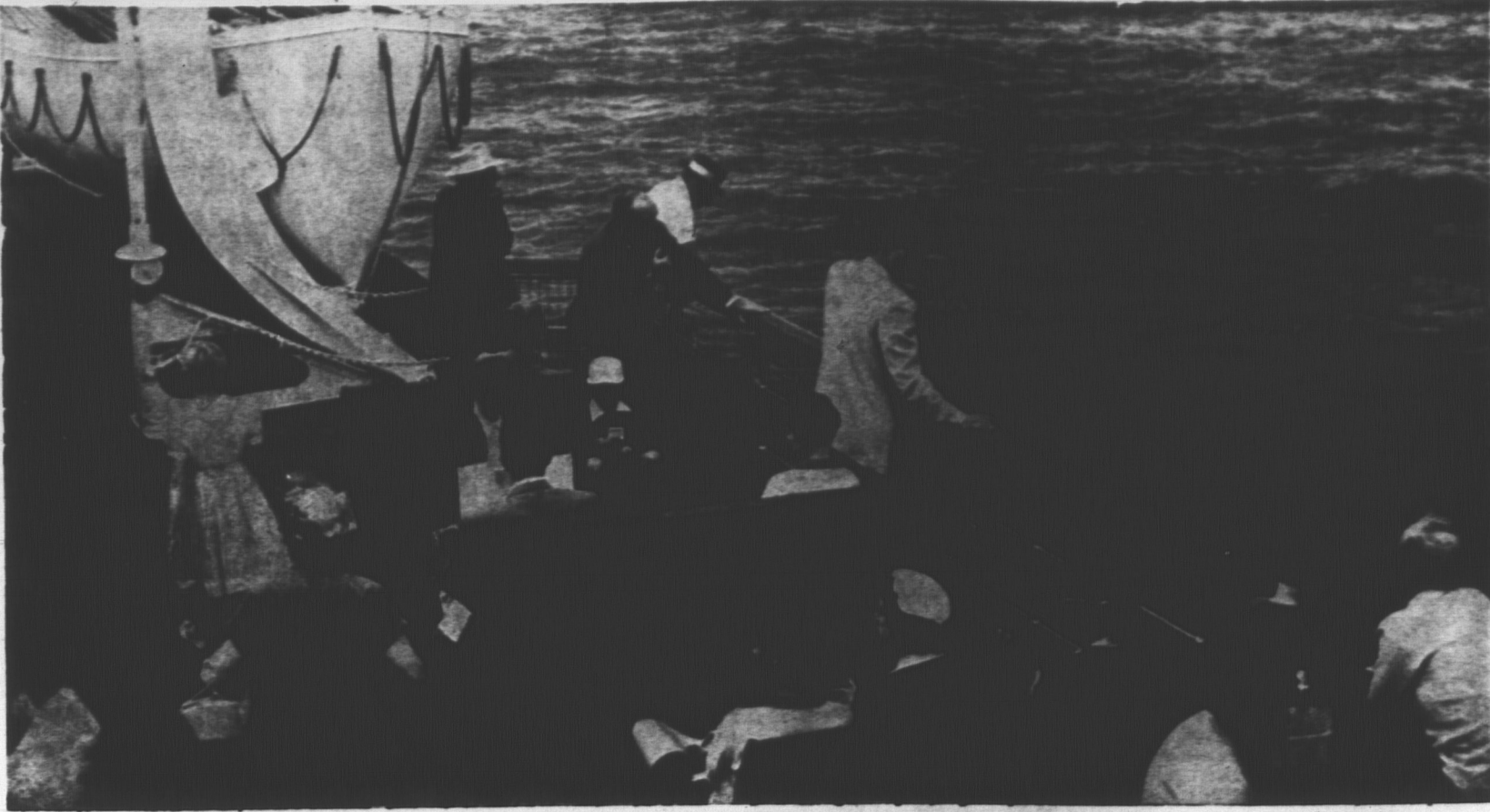
FERRY TRIP CREATES MOOD OF RELAXATION