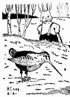
Longbill began to walk about.

Longbill began to walk about. He seemed to be listening. Wheth-