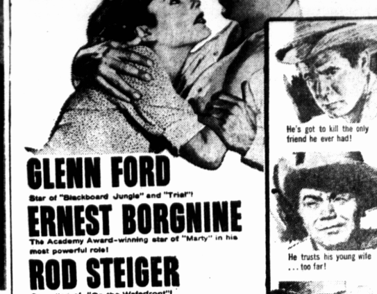
GLENN FORD Star of "Backboard Jungle" and "Trio!" ERNEST BORGNINE The Academy Award-winning star of "Marty" in his most powerful role! ROD STEIGER Sensation of "On the Waterfront!"

Trouble always clung to Jubal... like a wanton woman!