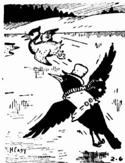
He gave a little hop and flapped his wings and was in the air.

Approaching danger undetected, Disaster strikes when least expected.—Old Mother Nature.