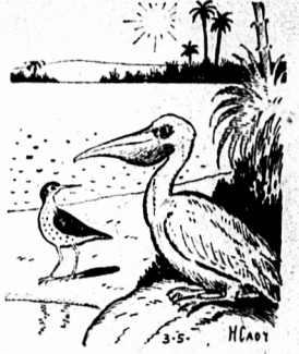
"Are you glad you are here?" he asked.

From the sandy beach not far away Teeter the Spotted Sandpiper flew over to a rock next to the one on which Grandpa Pelican sat dozing and dreaming. Grandpa Pelican blinked a sleepy eye at him. "Are you glad you are here?" he asked.