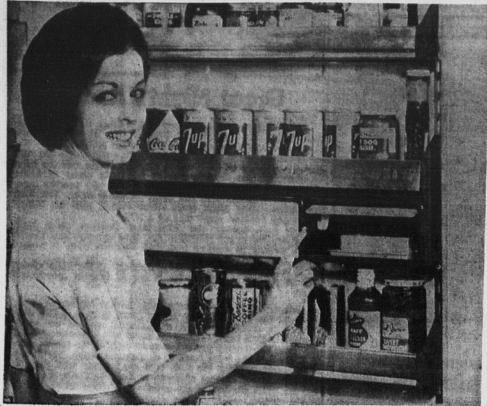
PUSH BUTTONS ARE AN ADDED CONVENIENCE TO HOUSEWIFE