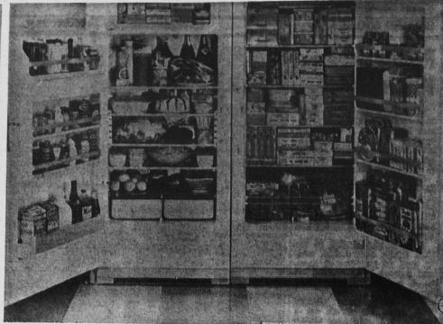
EVERYTHING FOUND HERE THAT A SUPERMARKET HAS PROPER PACKAGING IS KEY TO BETTER RESULTS

New control systems monitor both temperature and humidity preventing the formation of frost within the food storage areas. This exacting control of the air and its movement also increases the storage life of the foods.