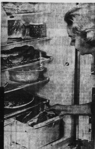
MEAT IS KEPT FRESH, TASTY

6. Fruits that are to be used primarily for pies, jellies or preserves can be washed and frozen in dry packs without sugar or syrup. Fruits can also be frozen in a dry sugar pack or in a syrup pack. 7. Meats should be wrapped immediately after cutting to prevent loss of juice and flavor.