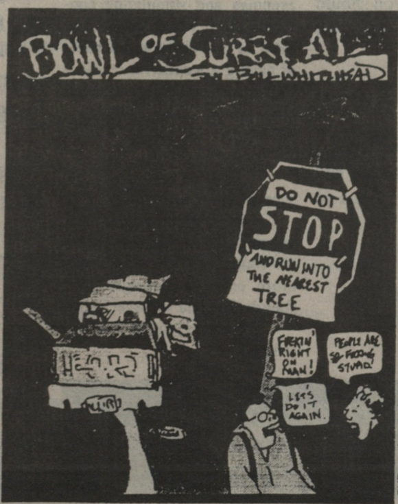
CUP graphic/ Bill Whitehead/ The Guelph Peak