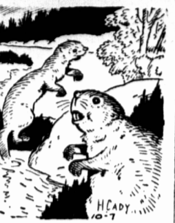
"I would go back another way or not go back at all," declared Little Joe.

He was surprised to see Paddy so far from home. Paddy told him that he was taking a vacation. When he asked if he was going back home he said he did not know. Laughing Brook down which he had come had almost dried up since he left home and he wasn't sure there was enough water in it to make safe travelling. Paddy never feels safe away from water deep enough for him to swim and dive. "I would go back another way or not go back at all," declared Little Joe.