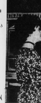
JEWISH WIFE and gentle husband play a scene from the "Merchant of Venice" one of The Bard's best liked plays came to life last night at St. Dunstan's University when the student players staged the production before an audience of approximately 500.