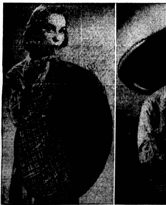
THE PATTERN OF A PLASTIC ROOF — A pneumatic rain hat that protects the wearer and at the same time leaves the hands free for carrying packages is the ingenious invention of a California manufacturer. The hat, which is made of lightweight