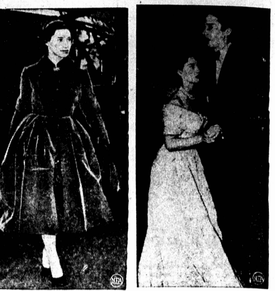
Fashion plate. A whim of Margaret's can change empire's fashions. Once she told Elizabeth: "You mind your old empire; let me mind my hats." Dancing a samba. The Princess' gay night-life is a subject of much comment. Her reported can-can at American embassy party sparked real controversy.

Since before she was 16, Princess Margaret has been linked romantically with Europe's young eligibles. Now 21, British newspapers hint there may be a royal engagement soon. (Tradition says any girl born at Glamis Castle in Scotland — as Margaret was, Aug. 21, 1930 — will choose a mate before age 21.) Question: Has Margaret chosen?