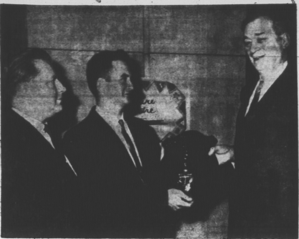
TOP AY POST AWARD IS PRESENTED