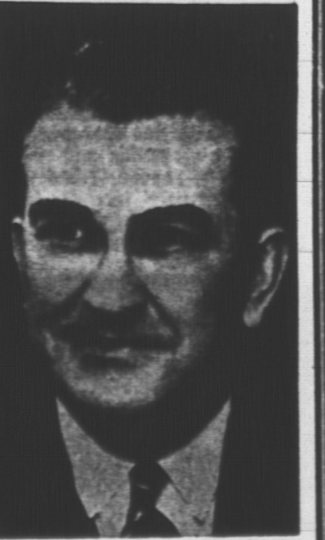
Hon. Angus MacLean, M.P.

GUEST SPEAKERS MURRAY RIVER PUBLIC HALL 8 P.M. Everybody Welcome — Refreshments