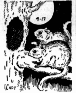
"It is perfect" she declared.