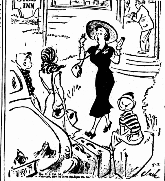
"Pop claims they're charging him for an extra dessert he didn't eat a week ago Tuesday!"