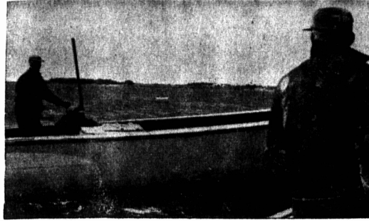
RESCUER COMES ALONGSIDE