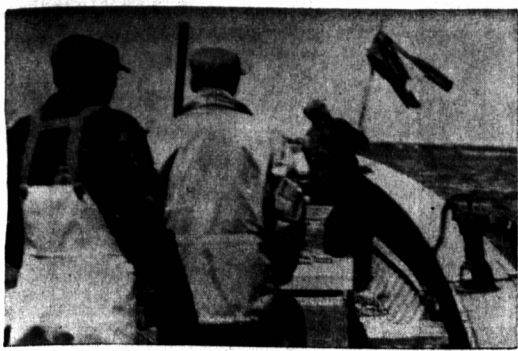
IN DISTRESS PROPELLER FOULED