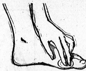
Special shape for bunions. Easily applied. Will stay in place.

You can go to work, out for a walk, or dance for a whole evening—wearing your same smart shoes— same feet—but never an ache from that sore spot. It is as wonderful as all that! Test it yourself.