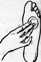
Wonderful for callouses or tender spots on sole.

Why not start in to relieve and heal them now?