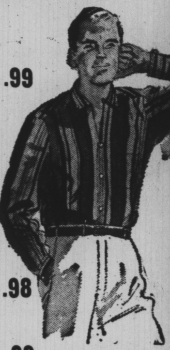
MEN'S WEAR AT BOTH STORES