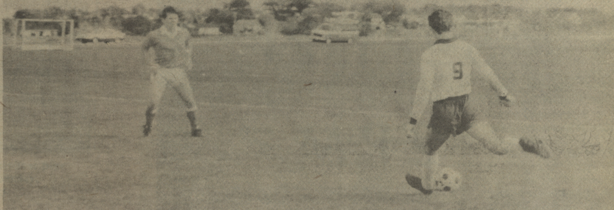
A Panther shows great form in soccer play over the weekend which earned UPEI a Number 2 ranking country-wide in CIAU standings.

Since writing the above and just as we go to press, we note that the C.I.A.U. rankings are out and that we are rated, in Soccer, as the 2 team in Canada! St. F.X. is #4, Mount A. #8 and Dalhousie #10!