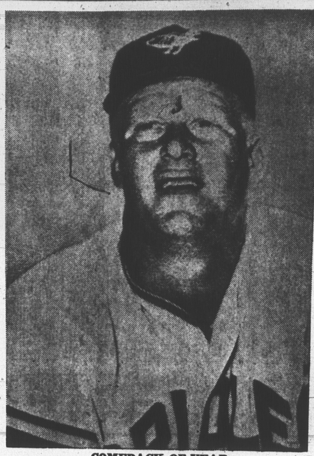
COMEBACK OF YEAR