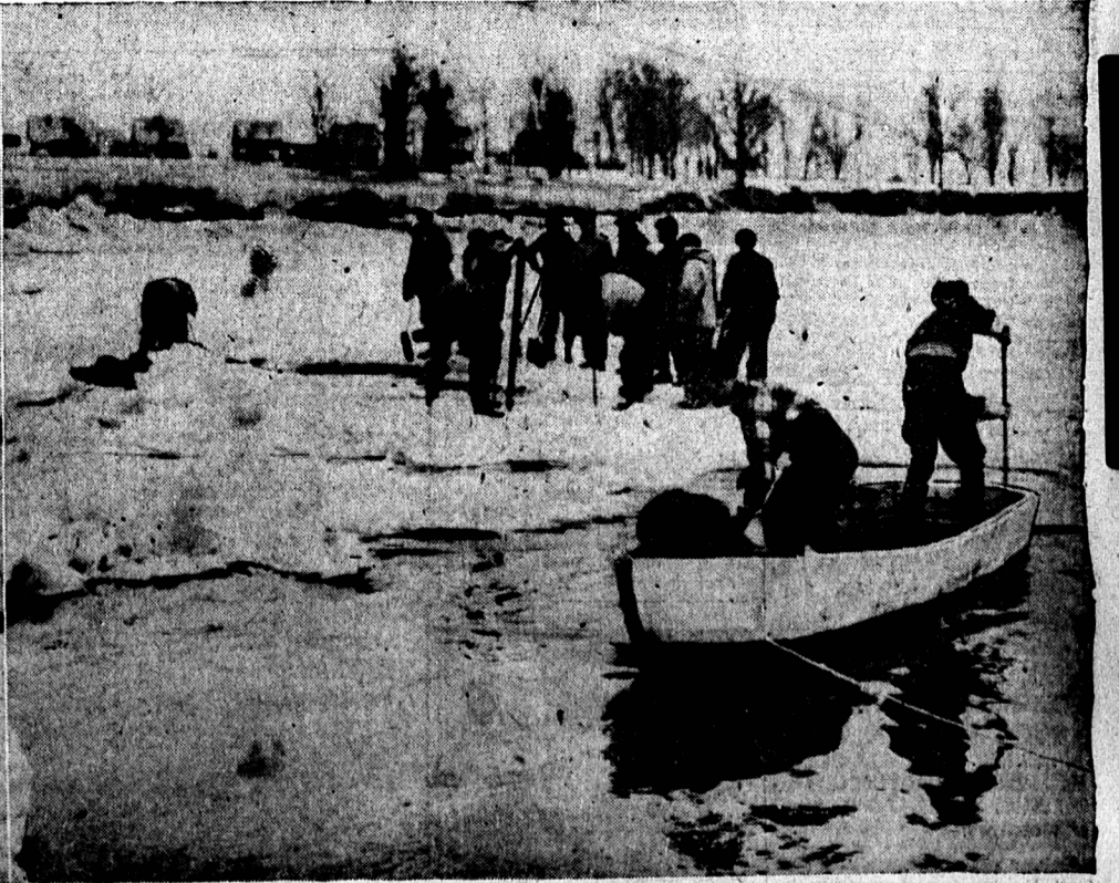
creek, drowned in 10 feet of water. Because of ice, first efforts to recover the body were unavailing. Police rounded up crew shown cutting openings in the ice for rescue operations, right. Two young friends of boy aged seven and nine, made unsuccessful rescue attempt. They then