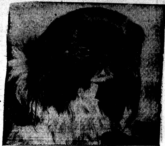
Scottish veterinary surgeons are baffled by this two-toned penguin "Blackie Boy," whose speech faculty is the talk of the village of Ceres. He says "hello," "yum yum" and a few other barely understandable words—and usually at the right time.