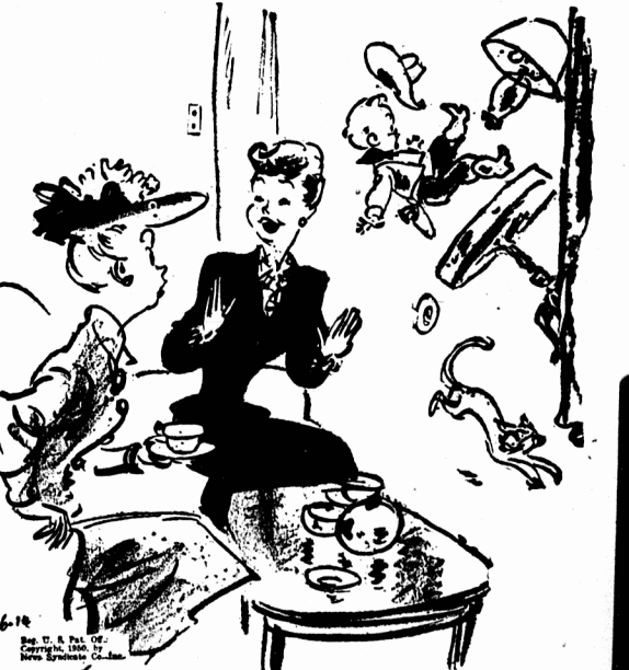
"Pay no attention to him. He's just trying to attract attention."