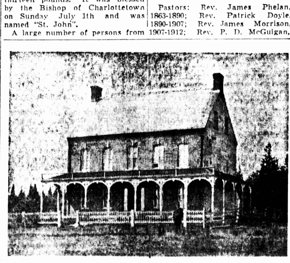
Parochial House at Vernon River built before 1886