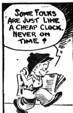
SOME FOLKS ARE JUST LIKE A CHEAP CLOCK. NEVER ON TIME.

During their stay in port, the "Quebec" will swing at anchor at the Three Tides in Charlottetown harbour while the two destroyers will be berthed at the Railway wharf.