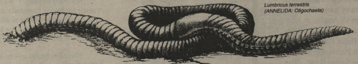
Lumbricus terrestris (ANNELIDA: Oligochaeta)

FOR SOME LIFE FORMS... SEXUAL HARASSMENT IS NOT AN ISSUE