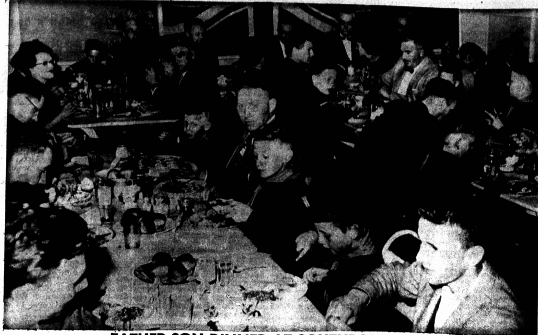
FATHER-SON DINNER AT SOUTHPORT