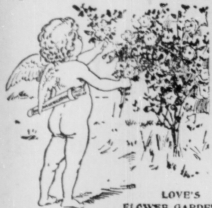
LOVE'S FLOWER GARDEN.