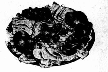
Dual-Temp Way: This "cold plate" of food was left uncovered for four full days in an Admiral Dual-Temp. Cool, dewy air kept every slice moist, fresh and tasty.