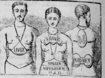
ST. JOHN'S, NEWFOUNDLAND, June 30, 1883.

Bill-heads, Letter-heads, Notes of Hand Receipts, Posters, Handbills, Dodgers, etc., etc., done in first-class style and at short notice.