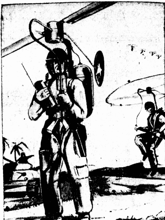
ONE-MAN 'COPTER UNDERGOES TESTS — A rocket-powered, one-man helicopter, weighing less than 100 pounds, may soon give a tremendous lift to the fighting man. Depicted above, the desk-top "pinwheel" would enable one man and special armaments to climb faster than an airplane, and noiselessly float or glide to earth. The self-starting, throttle-controlled contrivance has fuel tanks in the tips of its two small rotor blades, leaves no telltale flame in the sky and could be mass-produced. Developed for the Navy, it is being tested near Los Angeles.

MONTREAL, Oct. 29 — (CP) — Five match companies were found guilty today of forming and operating a monopoly controlling the Canadian match business and were fined a total of $85,000 and costs.