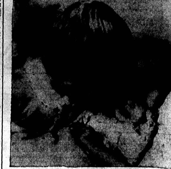
Two-year-old Bonnie Prince Charles, proud as a "big brother" can be, is seen kissing his tiny sister, Princess Anne, who is just one month old, as she made her camera debut. The new baby, first daughter born to Princess Elizabeth and Prince Philip, is third in line by succession to the British throne.

us what a place this is — a fellow can't put down anything and expect to find it again! Now that oil-can was right on the top of this here gate-post last evening . . .