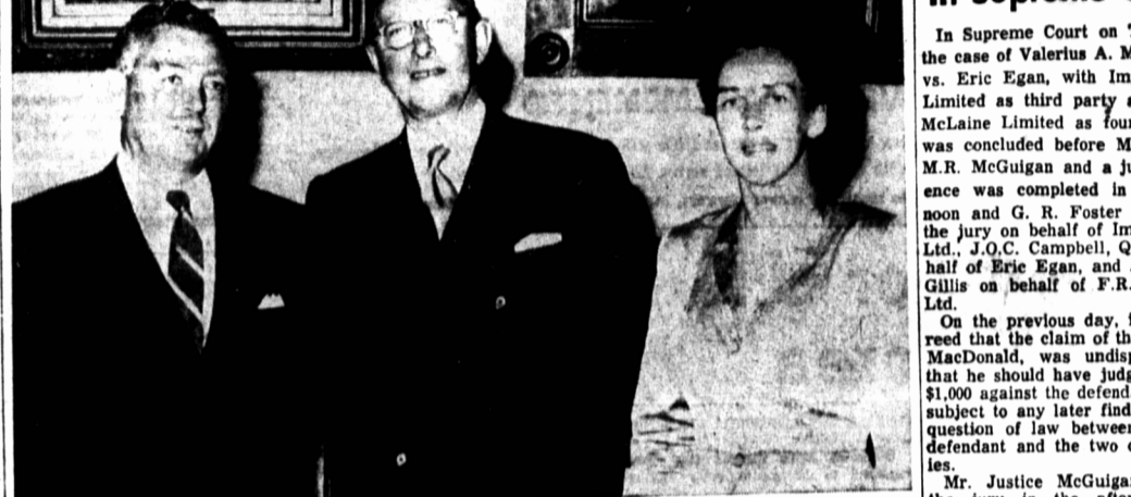
HIGH COMMISSIONER VISITS CITY HALL