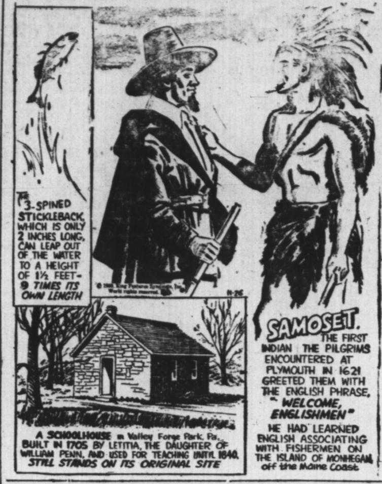
A SHOGHOLHOUSE in Valley Forge Park, Pa., built in 1705 by Letitia, the daughter of William Penn, and used for teaching until 1948. STILL STANDS ON ITS ORIGINAL SITE.

DAILY CROSSWORD ACROSS 1. Reigning beauty 6. Grayish 11. Shua 12. Estimate 13. Wong's dinner 14. Crowded 15. Transact 16. State park visitors 17. Chop 18. Elliptical 19. American Indian 21. Always 25. A setting 26. Push forward 27. Spreads grass to dry 28. Capital (Mass.) 29. Rip 31. Perform 32. Render insane 35. Music note 36. Occur, reoccur 37. Nip 38. Chop finely 40. Shaver's instrument 41. Senior 42. French river DOWN 1. The court 2. Jury's concern 3. Crazyword