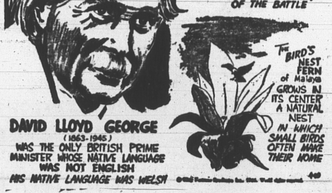
DAVID LLOYD GEORGE (1863-1945) WAS THE ONLY BRITISH PRIME MINISTER WHOSE NATIVE LANGUAGE WAS NOT ENGLISH HIS NATIVE LANGUAGE WAS WELSH