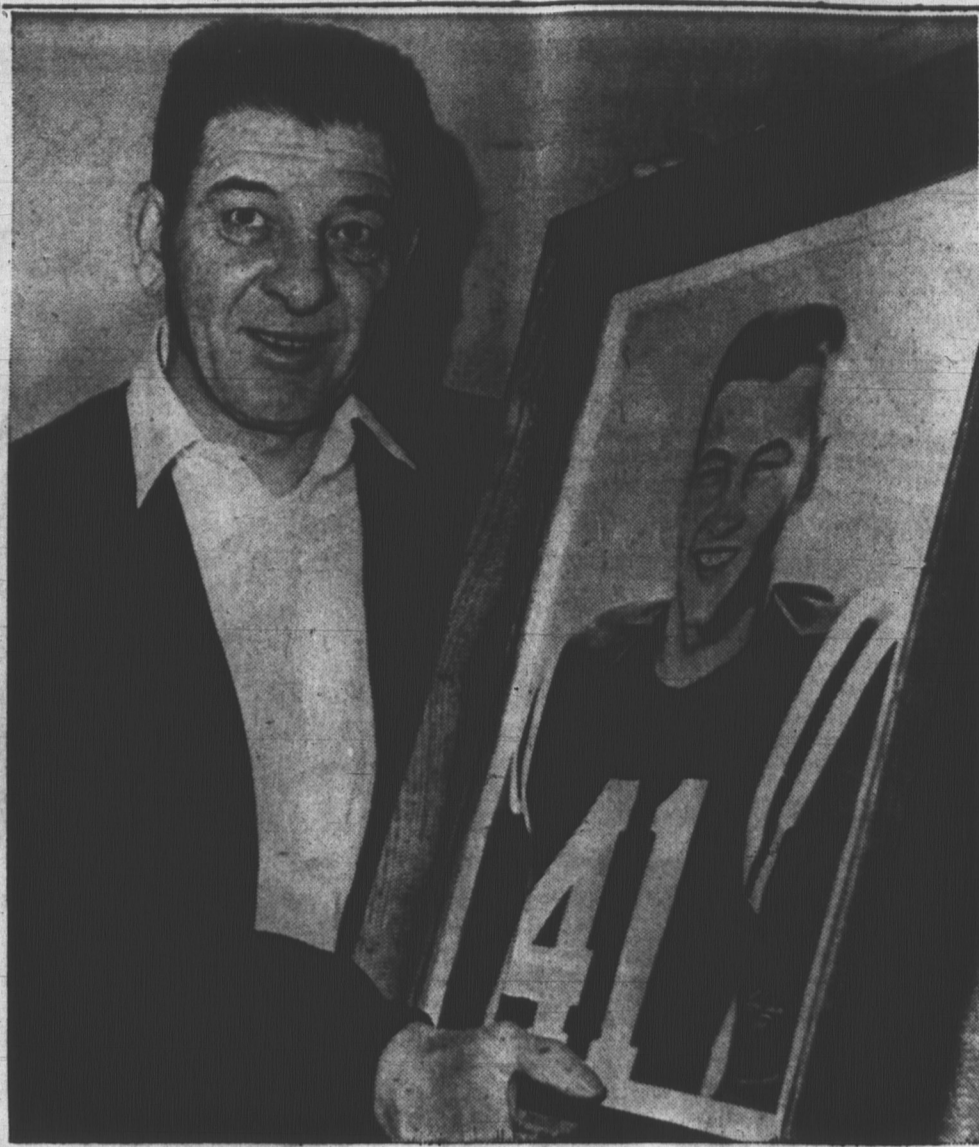
THAT'S MY BOY