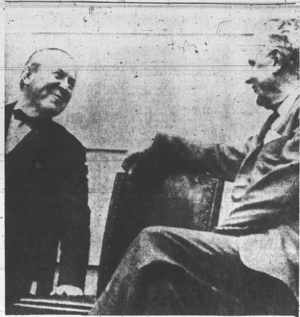
THEY'RE ALL SMILES

The 'Guardian' Charlottetown, Fri., June 3, 1966. 5