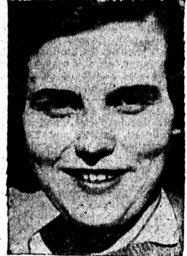
PRINCESS DE RETHY