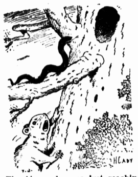
The big snake was just reaching up to look into that doorway.

their eyes would open. So of course they needed mother's care every minute of the day and night. There was no one to help her. Father didn't even know he was a father. He wouldn't have been any help if he had known. Indeed, it was probably better that he didn't know. Squirrel fathers are poor fathers. Mrs. Happy Jack begrudged every minute she was away from the babies. She did have to go out every day. She had to look for the food. But all the time she was away from that home she did her best to keep a watchful eye on it. She three weeks old. They had been born without any little fur coats. They were still blind, and quite helpless, but growing every day. They would be at least five weeks old before