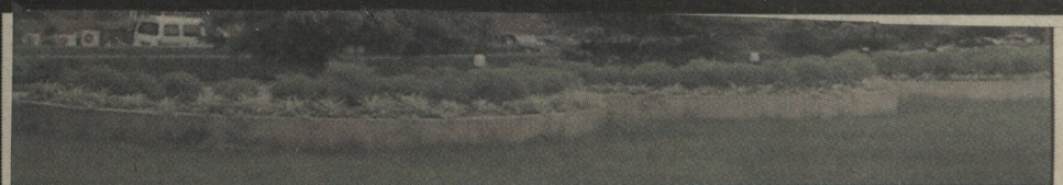
Sichuan University - China.

librarian to work on their library skills and many of the resources our own students receive."