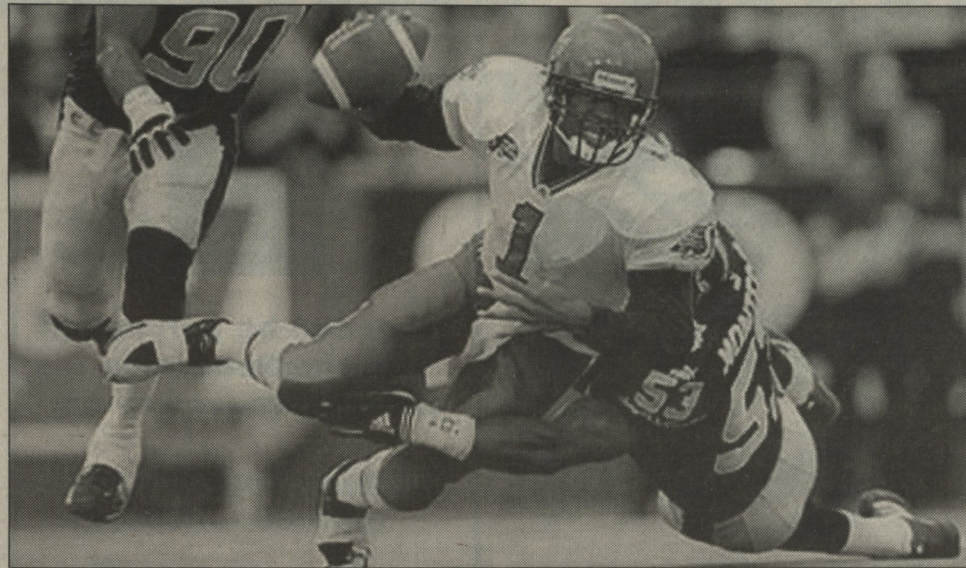
The Ti-cats take down the Rough Riders.

Not so the Canadian contingent of soldiers sent to Cuba to deal with marauding Spaniards in the late 1800's. The Canadian Rough Riders were the heroes of the Spanish-