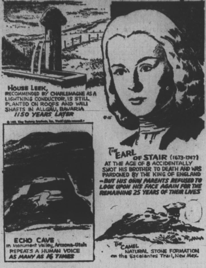
HOUSE LEEK, RECOMMENDED BY CHARLEMAGNE AS A LIGHTNING CONDUCTOR, IS STILL PLANTED ON ROOFS AND WALLS SHAFTS IN ALLGAI, BAVARIA 1150 YEARS LATER.