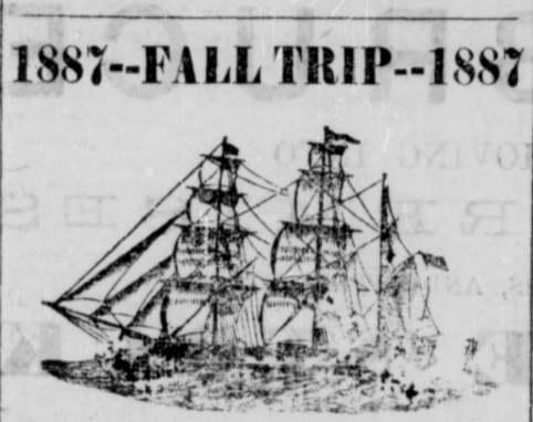
The well-known Clipper Barkentine