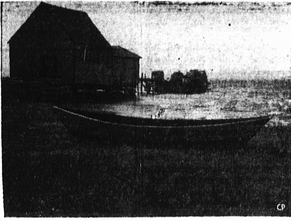
HIGH AND DRY—A trick of the tide at Rustico Harbor, P. E. I. has left this dry high and dry in a sea of grass. An anchor thrown out

astern has its fluke sunk in the soft soil as though to prevent the craft drifting away.