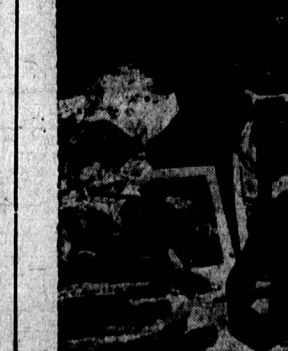
Arsenal of guns, crowbars, detonators and other equipment was seized by police when they raided a house hours after hold-up. Also seized was $300, which police claim is part of loot taken from bank.