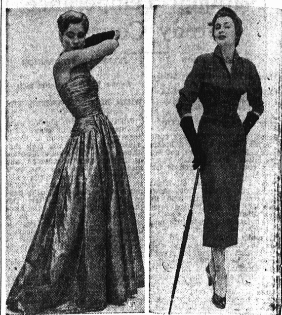
A "cloth of gold" evening dress has been designed by British stylists for coronation year. It is an entry in the race between synthetic and natural yarn fabrics—being made of rayon gauze and a real gold thread.

LONDON, Oct. 28—(CP)—London's first coronation fashion parade in the spacious Royal Festival Hall, illustrated the revolution now taking place in fashion fabrics.