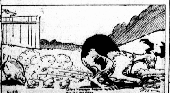
The meeting was then adjourned.