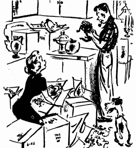
"I think it slices or peels something—anyway it was one-fourth off."