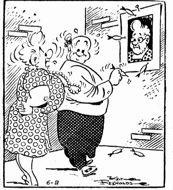
"Okay, we'll look in the Guardian Want Ads for a house with a recreation room—since you insist on throwing darts at my relation!"