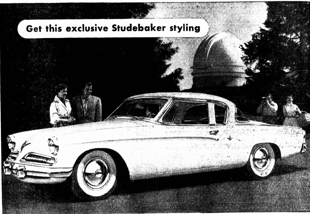
Illustrated: Studebaker Commander V-8 Regal Starlight coupe for five. White sidewalls and chrome wheel discs optional at extra cost.

Makes every other Canadian car look 10 years older!