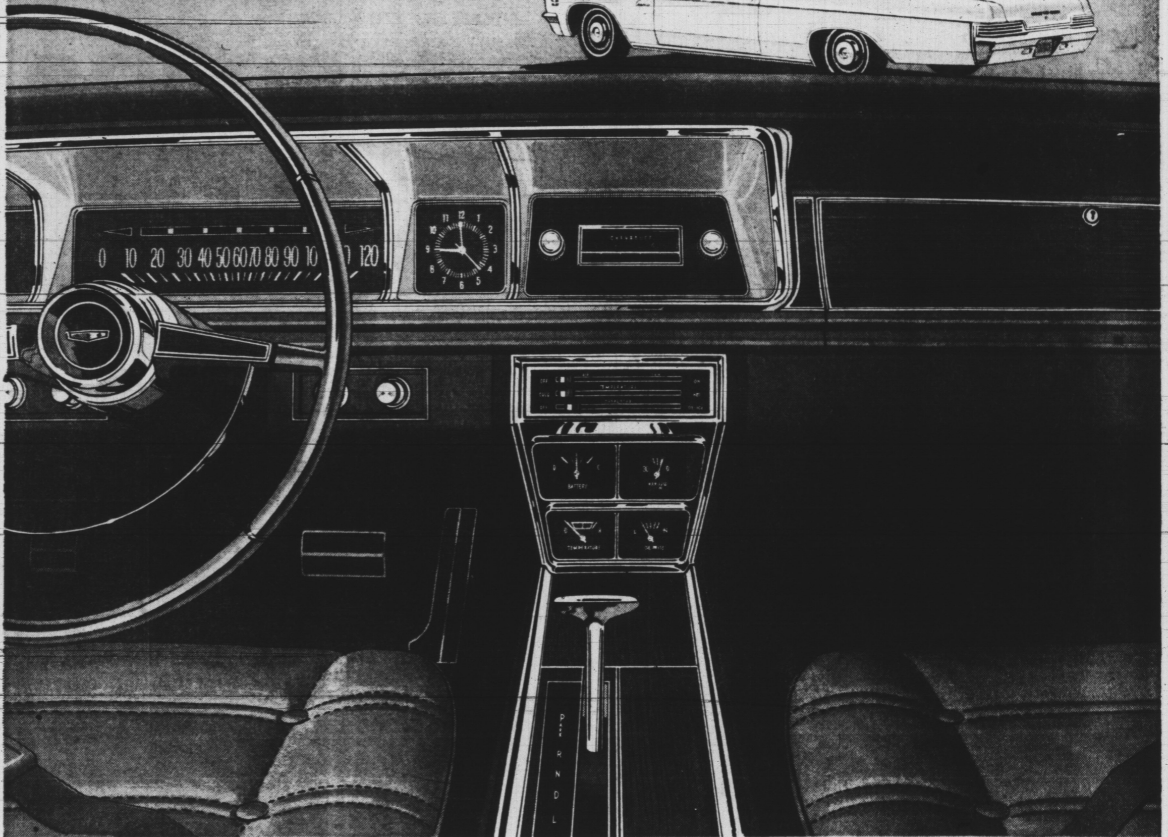
Caprice Custom Coupe