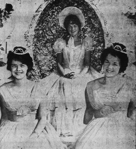
BEAUTY WAS EVERYWHERE AS THIS HOLMAN'S TRIO PROVES